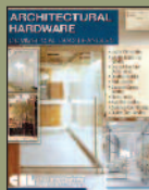
Commercial Door Handles