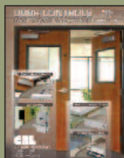
Door Controls Hardware and Accessories