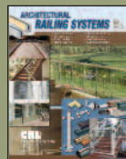
Architectural Railing Systems