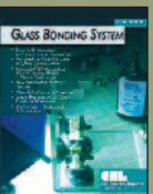
Glass Bonding System