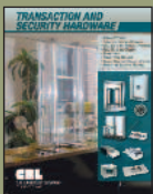
Transaction and Security Hardware