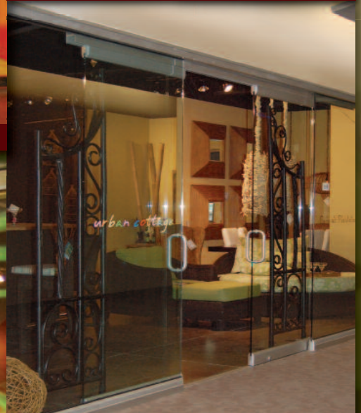
SDR Bottom Rolling Sliding Doors