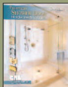
Frameless Shower Door Hardware and Supplies