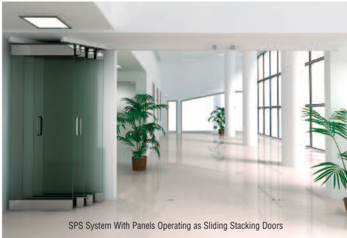
SPS System With Panels Operating as Sliding Stacking Doors