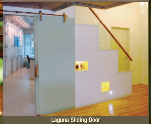
Laguna Sliding Door