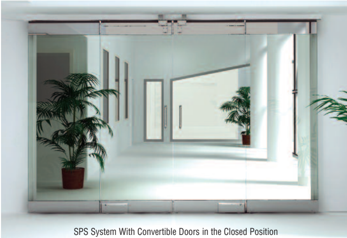
SPS System With Convertible Doors in the Closed Position