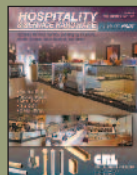
Hospitality & Service Hardware