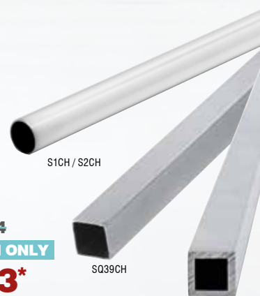
S1CH / S2CH