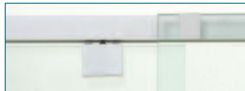
Fixed Glass Connection to Header

Includes: Gaskets, Screws, and Glass Fabrication Information