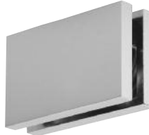
Square Clamp Style