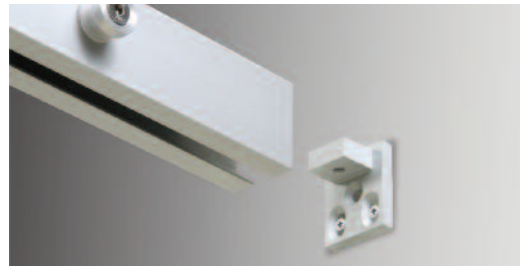
Optional Use Wall Mount Bracket (Included with 180 Degree Kits)