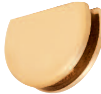
Rounded Clamp Style