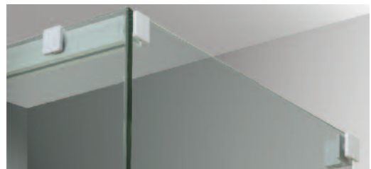
Optional 90 Degree Return Bracket and Wall Clamp (Sold Separately, See Below)