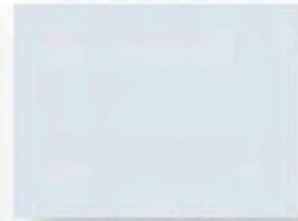
Stone White UC74946