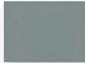
Stone Gray UC74945