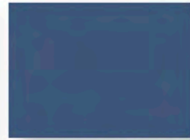
Regal Blue UC70566