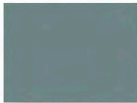
Sea Spray UC115881F