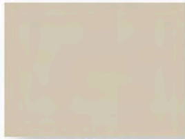
Pueblo Tan UC74756