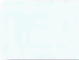
Bone White UC43350