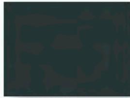
Hartford Green UC70572