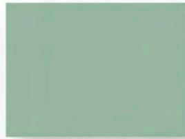
Aged Copper UC74956