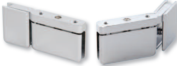
Cat. No. PPH07 180°