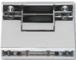
Cat. No. GTC037 SQUARE CORNERS