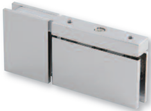
Cat. No. CAR07 180°