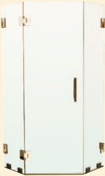
Typical Header-Free Design (Glass Not Included)

New Products + Special Design Criteria = New Looks for Frameless Shower Door Installations