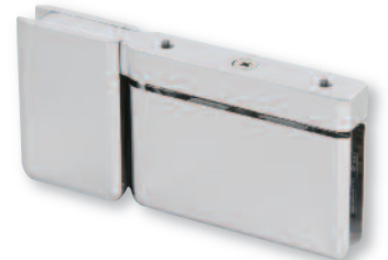
Cat. No. SRPPH07 180°