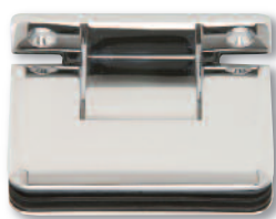
Cat. No. PTC037 BEVELED EDGES