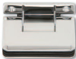
Cat. No. PTC037 BEVELED EDGES